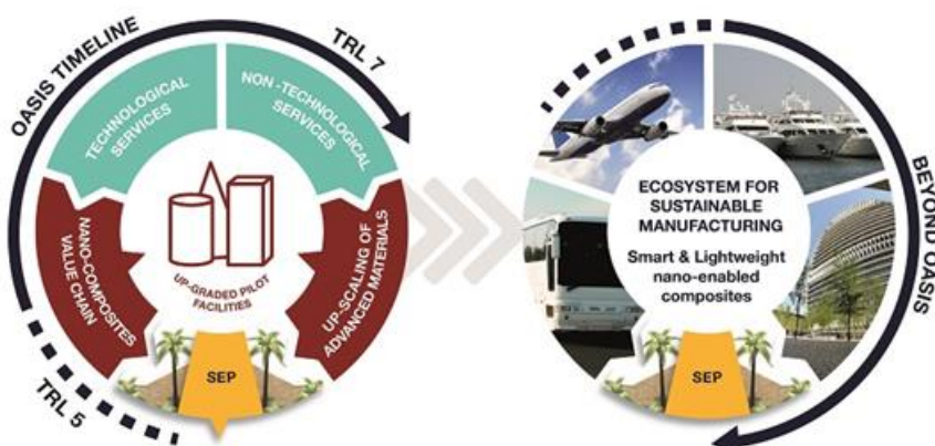
OASIS ecosystem for SUSTAINABLE pilot production